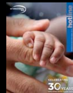
Cover: Celebrating 30 years of worldwide reach and human touch

International SOS is making sure clients get the most out of their medical and travel risk solutions.